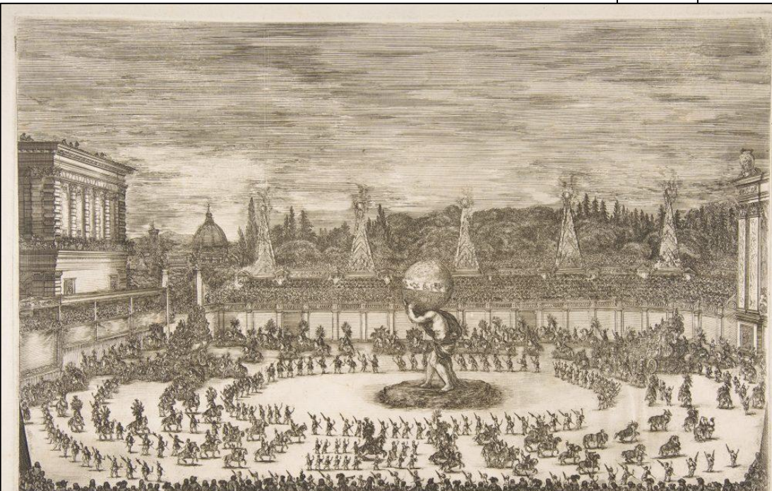
Comparia del Ser. Principe di Toscana Figuran' Ercole Accompa' dai Cati del Sole e della Luna, seguito de' Cavalieri d'Europa, America, Asia ed Africa. Nella Festa a Canale Rappre' per le Reali Nozze dell' A. J. 1774. Nel Teatro Olimpico di Palazzo Pitti. Del Ser. G.D.