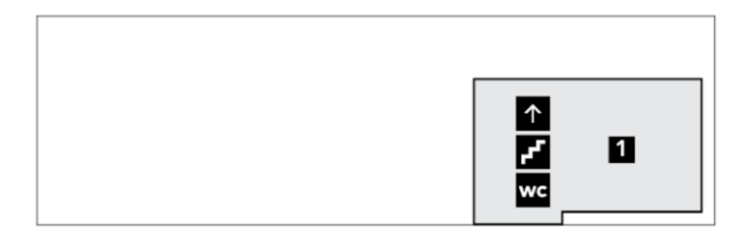
FLOOR -1 (1 – Conference Center)

EURIG seminar and Members' Meeting will be held at the <u>Public Area</u> (Conference Centre on the Floor -1) of the National Library of Latvia in Riga, also called the Castle of Light ( Gaismas pils in Latvian). EURIG delegates will use Main Entrance from the Uzvaras bulvāris (Uzvaras Boulevard) side. Address of the Library: Mukusalas iela 3, Riga, LV-1423, Latvia.