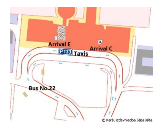
Bus and taxi stops at the airport