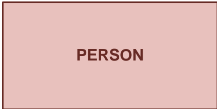
Person Carries No Core Relationships