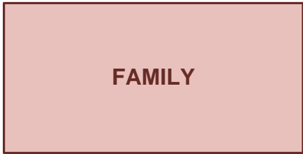
Family Carries No Core Relationships